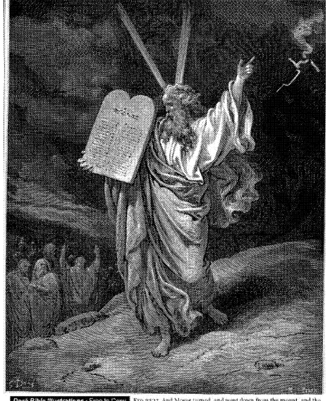
6 Bible illustrations - Free to Copy Exo 3233 Anti Moses tamoti, and went down from the mount, and the two tables of the testimory users is his hand: the tables users written to tables of the testimory users is his and or the other reset from written

"Moses Coming Down From Mt. Sinai" by Gustave Dore