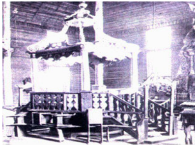
The bimah in the wooden shul of Gombin (now Gabin) Poland, which was destroyed by the Nazi's.

The last item is likely to prove the most difficult (see details below). If you could help us with any of these, please be in touch.