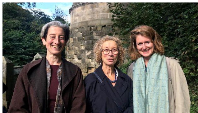
Three of our singers at Tashlich