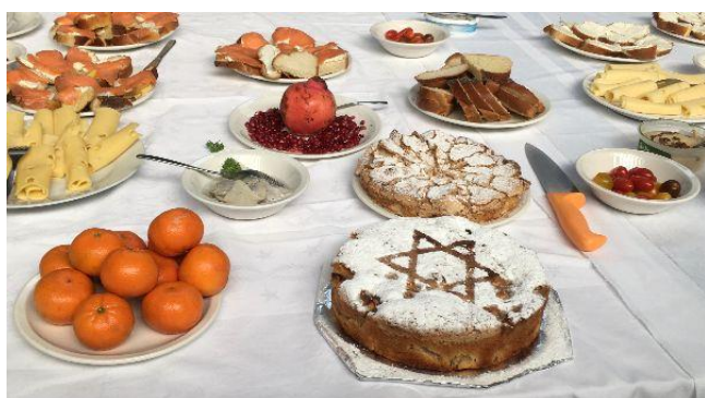
Rosh Hashanah Lunch