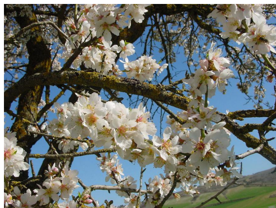
Almond tree in blossom