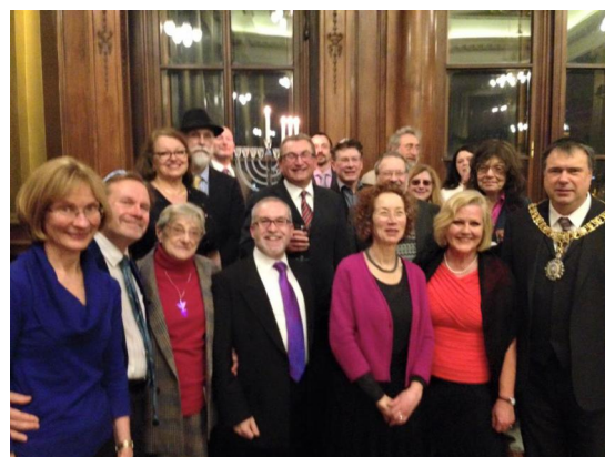
Last year at the City Chambers