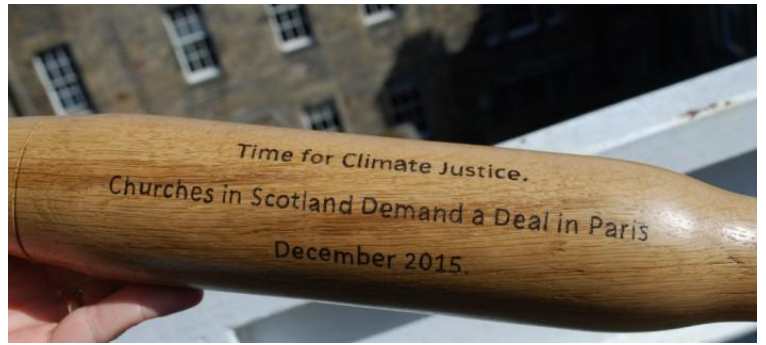
Scotland's Eco-Congregations Baton on its way to the Paris Climate Summit

This year Scottish Interfaith week will run from 22 to 30 November , with the theme of Care for the Environment. Always an important topic; more so this year, with the United Nations Climate Change Conference about to start in Paris on 30 November.