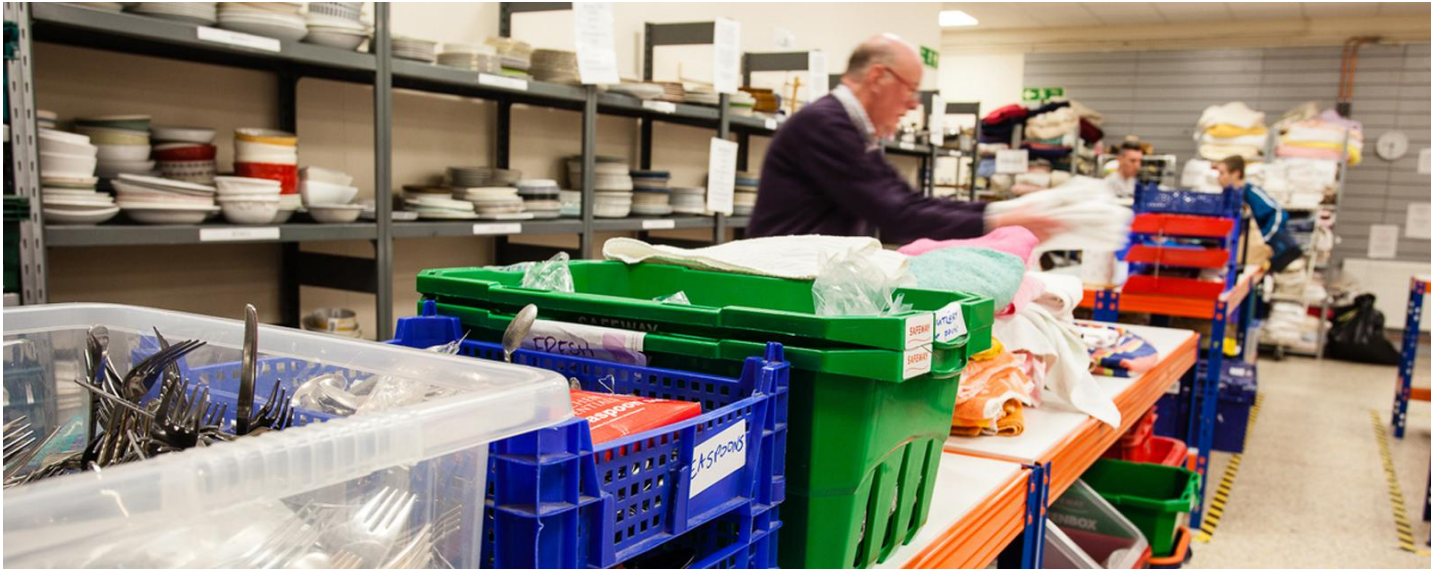
Fresh Start's sorting station for donated homeware