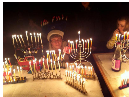
Our mass chanukiah lighting three years ago