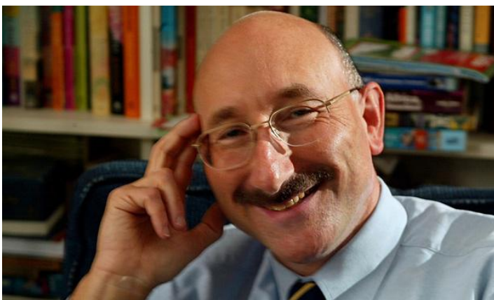
David Cesarani in 2004 (from his obituary in The Guardian )

Cesarani believed that Israel's right to exist is unquestionable and he was strongly critical of academic and business boycotts against Israel in the United Kingdom. However he was equally critical of Israeli government policy, conduct, and expansionist sentiments. He was careful to stress that criticism of Israel's government or Israeli society is not a priori anti-Semitic. He was clear that it is possible to support the Palestinian struggle against the occupation and for a viable state without endorsing the murder of innocents or conspiracy theories about Jews. In an article of 26 January this year, he deplored the current hysteria about the rise of anti-Semitism. He argued that Jews are not socially or legally isolated, as they were in the 1930s and 1940s, but find themselves enjoying unprecedented solidarity.