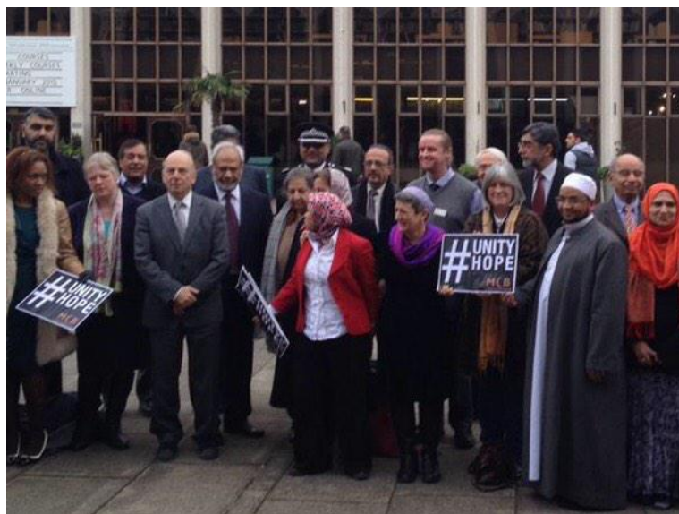
The Interfaith Manifesto was launched at the London Central Mosque.

Along with Liberal Judaism, the Edinburgh Liberal Jewish Community is a signatory of the Interfaith Manifesto . Other signatory organisations include the Movement for Reform Judaism and the Muslim Council of Britain. An initiative of the Jewish Council for Racial Equality (JCORE), the Manifesto is endorsed by Jews, Muslims, Hindus, Protestants, Catholics, Methodists, Quakers, Sikhs and Buddhists, and offers 'a moral voice on immigration and asylum'. It was launched in March at the London Central Mosque, which two weeks later was the target of a vicious demonstration by the neo-fascist Britain First.