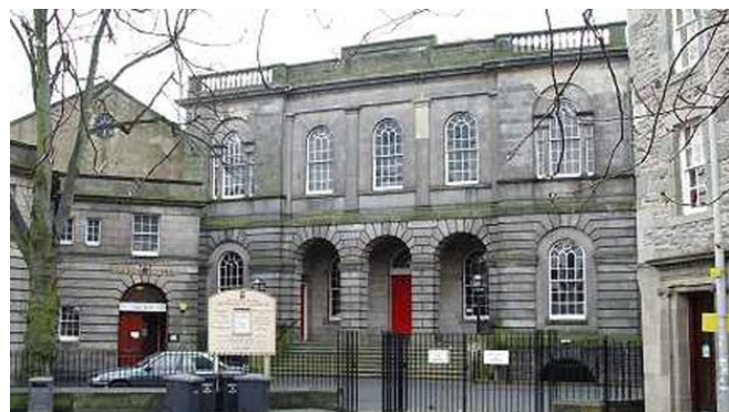
The new EIFA offices will be housed in the recently refurbished City Methodist Church