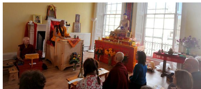
The shrine room at the Kagyü Samyé Dzong Centre