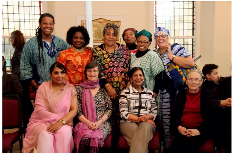
The Zawadi Alba Choir, with members of Edinburgh Interfaith Association.

On 4 May, Edinburgh Interfaith Association (EIFA) held the official opening of their new office at the City of Edinburgh Methodist Church in Nicholson Square. This was a very happy event and well-supported by a number of ELJC members. Those present were treated to a nourishing diverse blend of music and dance followed by an (equally nourishing) tasty meal. One of the highlights of the evening was the performance of the Zawadi Alba Choir (pictured). Zawadi Alba is a group which welcomes women from different ethnic backgrounds. It has been operating since 2009 and is based in Edinburgh.