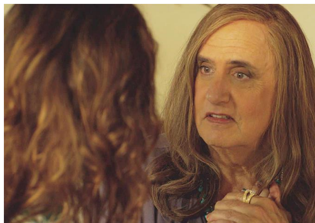
Maura comes out to her daughter (Amazon Prime 2014; see also the trailer on Youtube )

I'd seen programmes and films featuring transgender people before, and this was the first example I've seen in a Jewish setting. Transparent succeeds in highlighting issues of transitioning among people who have no direct experience of it. It remains to be seen, however, whether the portrayal is seen as accurate by trans people themselves. The focus of the series is definitely on the issue of transgender, but can also speak to others, since, as Soloway points out: “My work privileges the Other, with a capital ‘O,’ meaning all kinds of other — Jewish, trans, gay, unattractive, weird, freaky, outsider, different, f—d up”.