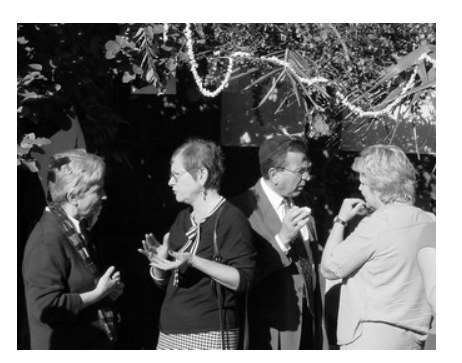
Under the Sukkah

This must be a first – a child complaining that a service was too short! More pictures on the website.